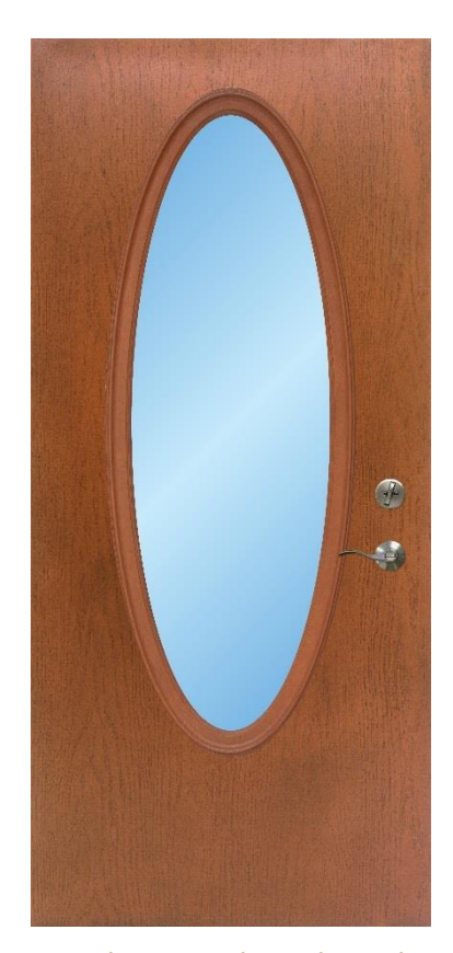
Oval Textured Steel Finish Walnut Stain Obscure Glass Camelot Hardware Satin Nickel Finish Inside Accent Flair *Available in Fiberglass

Embossed 20-gauge smooth or textured wood grain steel with a full wood frame.