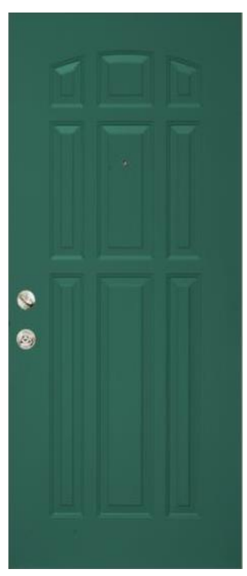
Davis Smooth Steel Finish Forest Green Paint Addison Hardware Satin Nickel Finish Inside Georgian Knob

Nine Panel Embossed 20-gauge smooth steel with a full wood frame.