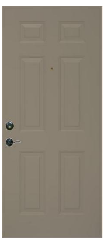
Owen Smooth Steel Finish Clay Paint Plymouth Hardware Aged Bronze Finish Inside Accent Lever *Available in Fiberglass

Six Panel Embossed 20-gauge smooth or textured wood grain steel with a full wood frame.