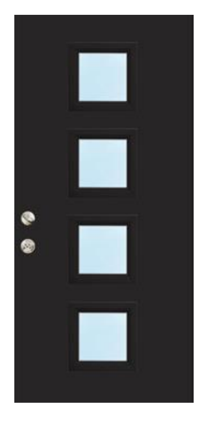
Square Smooth Steel Finish Coal Black Paint Addison Hardware Satin Nickel Finish Inside Georgian Knob

Full Panel Embossed 20-gauge smooth steel with a full wood frame with clear glass.