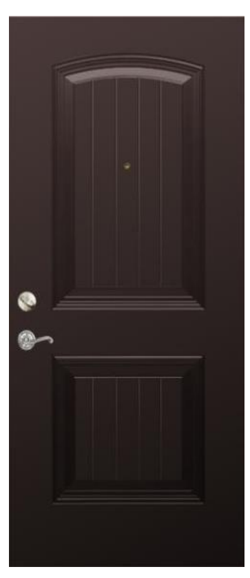
Bradford Smooth Steel Finish Rustic Bronze Paint Camelot Hardware Satin Nickel Finish Inside Flair Lever

Two Panel Embossed with planking 20-gauge smooth steel with a full wood frame.