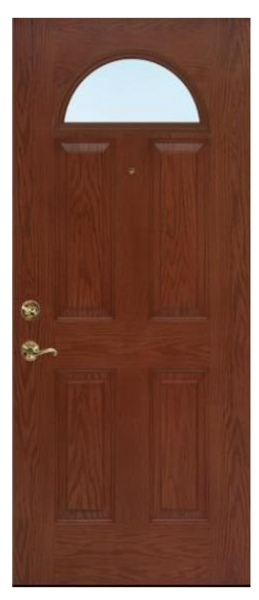
Jamison Textured Steel Finish Cherry Stain Plymouth Hardware Bright Brass Finish Inside Flair Lever *Available in Fiberglass

Four Panel Embossed 20-gauge smooth or textured wood grain steel with a full wood frame.