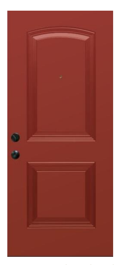
Barrow Smooth Steel Finish Mountain Berry Paint Addison Hardware Aged Bronze Finish Inside Georgian Knob

Two Panel Embossed 20-gauge smooth steel with a full wood frame with paint finish.