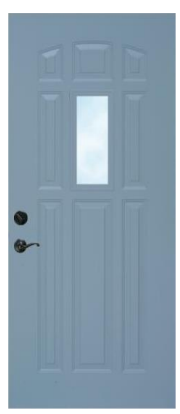
Edmonton Smooth Steel Finish Geneva Blue Paint Clear Glass Plymouth Hardware Aged Bronze Finish Inside Flair Lever

Eight Panel Embossed 20-gauge smooth steel with a full wood frame with clear glass.