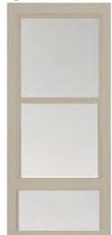
Self Storing with Adjustable Half Screen (available with kick plate)