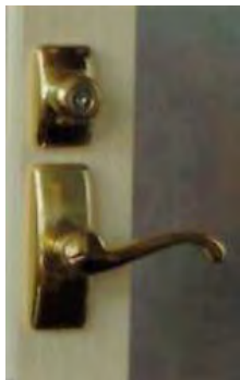
Bright Brass Lever