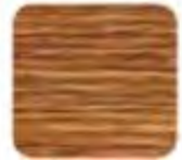
Dark Oak (Woodgrain)