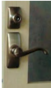
Satin Nickel Lever