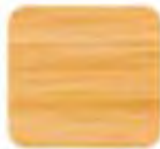
Light Oak (Woodgrain)